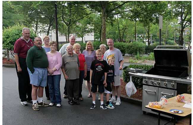
Volunteers gather at Victory House for the cookout.