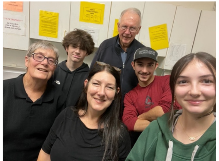
VOLUNTEERING AT VICTORY HOUSE!