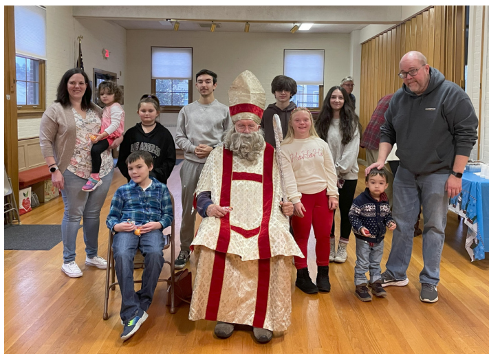
VISIT BY ST.NICHOLAS 12.10.23