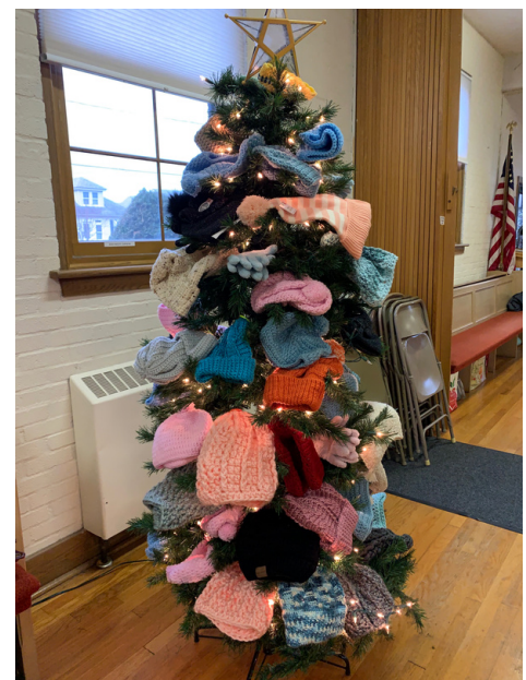
OUR 2023 MITTEN TREE